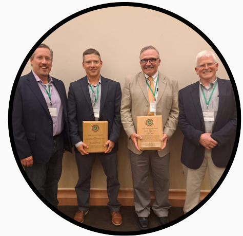
Outstanding Manufacturing Award