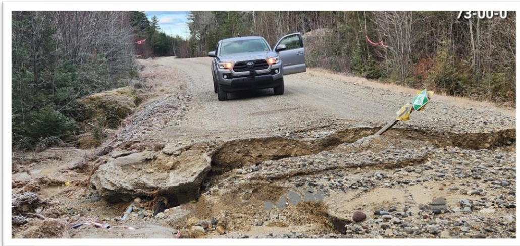
73-00-0 Road in Osborn TWP, road washed after December 18 th . Note the sign indicating the road is also an ATV trail.