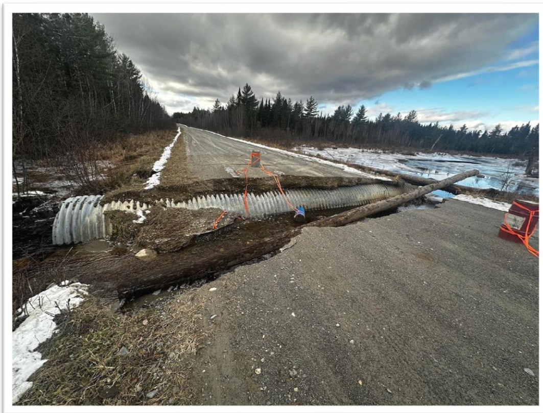
Stud Mill Road is impassable in TWP32 after the December 18 th storm. Numerous Bear Hunting Leases are accessed off Studmill Road.