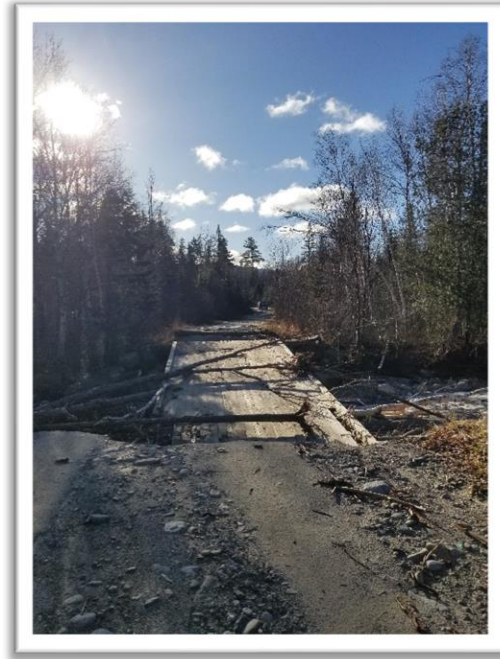
50ft bridge over Nash Stream in Coplin TWP washed out in December 18 th storm. This bridge also services ITS 89, a main snowmobile and ATV trail between Eustis / Stratton and Rangeley.